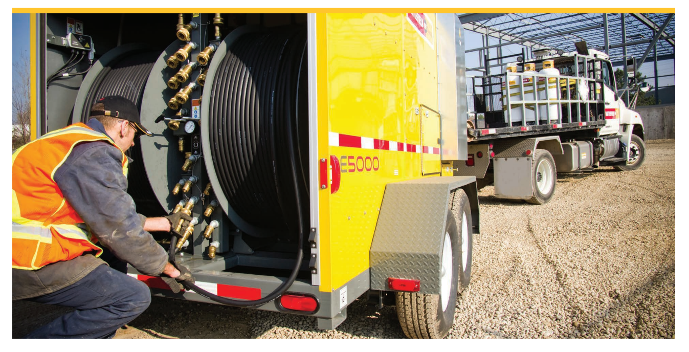
Customers count on Battlefield to deliver the right equipment, including this hydronic heater, at the right time, to ensure their construction projects are completed on time.

Toromont earned $3.07 per diluted share in 2018, 40% more than in 2017, reflecting good operating performance across the business together with accretion from Toromont QM, our acquired operations. On higher earnings, return on opening shareholders' equity was 22.3%.