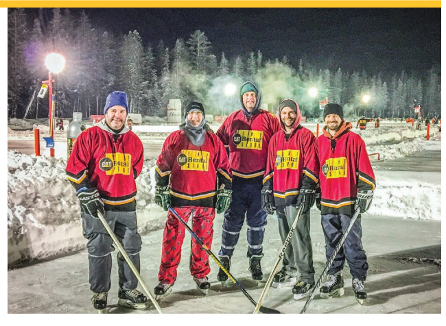
Toromont is a proud supporter of the annual World Pond Hockey Championship in Plaster Rock, New Brunswick, which attracts over 100 amateur teams playing on 20 outdoor ice surfaces.

In managing our fleet of vehicles, which is the largest contributor to greenhouse gas (GHG) emissions in our business, fuel