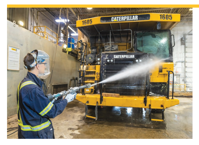
Toromont continues to invest in upgraded wash bays to realize improved water efficiency.